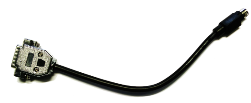
Figure 1 - CablePTC04- A3

It should be used during the development of the EOL programming sequence on the PTC04 for the Melexis IC mentioned above.